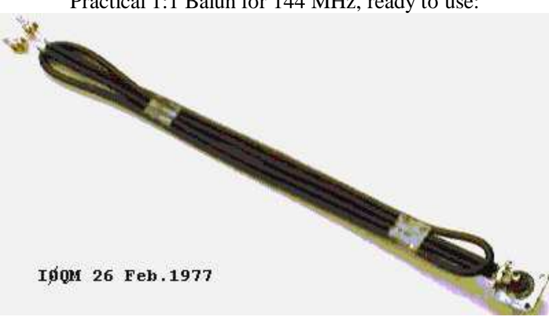
Practical 1:1 Balun for 144 MHz, ready to use:

Legal-notice/Disclaimer/Warning: This Document contains station information only; I0QM, Bob; is a Hobbyist Amateur Radio! In The Spirit Of Amateur Radio, No Monetary Profit is to be made from this Personal Page Publications and it is released for free at amateur radio without support or warranty of any kind, commercial use or commercial distribution is not allowed; the use of the information provided is at your own risk. Parts of the pages or the complete publication including any information might be extended, changed, or partly or completely deleted without announcement. 73's fb DX de I0QM.